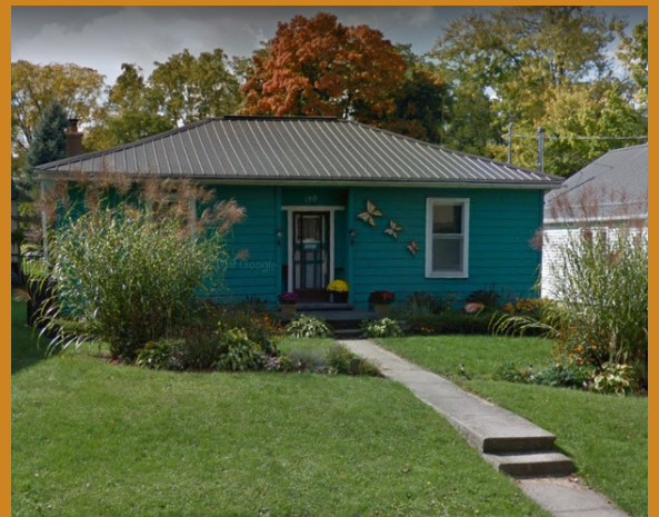
140 Carroll Street, Ingersoll

As a child he displayed a natural athleticism. When he enlisted in the 168th Battalion on 2 February 1916, he listed his occupation as "athlete."